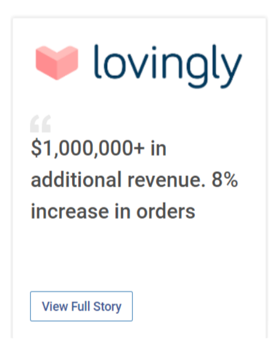
See All Case Studies